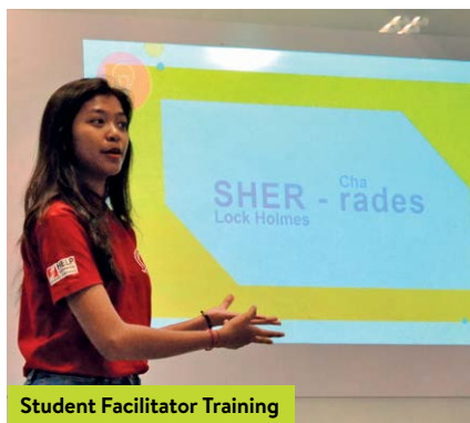
Student Facilitator Training