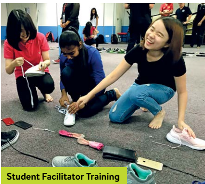
Student Facilitator Training