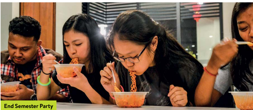
End Semester Party