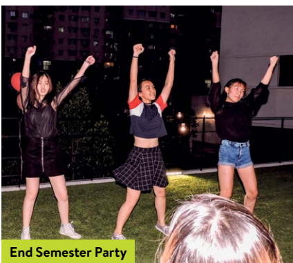
End Semester Party